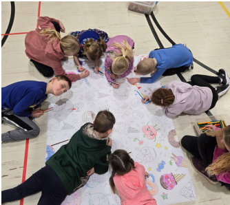
Morning care coloring crew!!

Sign up for one shift or both. First shift: 11:10-11:50 am. Second shift: 11:40 am-12:20 pm