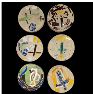
4th and 5 th Grade Themed Pavers