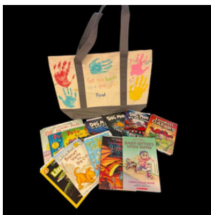
3rd Grade Book Bag and Favorite Books