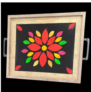
1st Grade Tray with Original Artwork