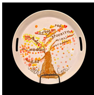
2nd Grade Hand-Painted Ceramic Platter