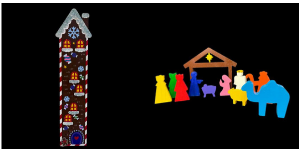
Pre-Kindergarten Advent House and Hand-Painted Nativity Set