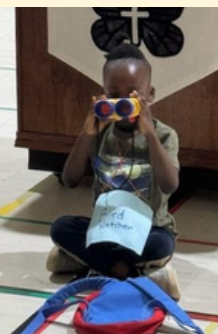
Day 5 - The Naturalist