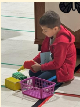
Day 3 - The Concrete Worker