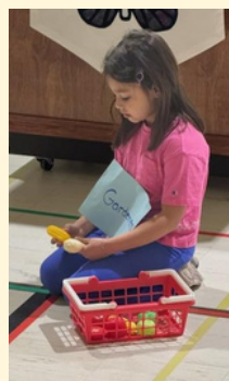
Day 3 - The Gardener