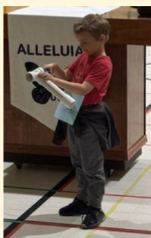
Day 2 - The Plumber