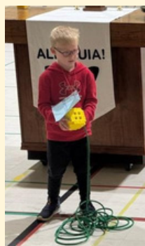
Day 1 - The Electrician