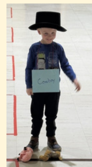
Day 6 - The Farmer