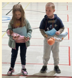
Day 6 - The Moms and Dads

Our kindergarten class provided a wonderful illustration for the Creation story at chapel this week.