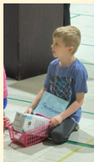
Day 4 - The Storekeeper