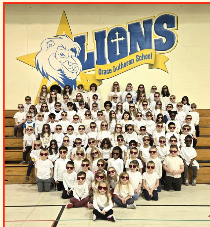
This year's all-school Giving Hearts Day photo.

Grace Lutheran School shattered records with this year's Giving Hearts Day. We were generously blessed with $53,000 in donations to further our scholarship ministry. We are so grateful for our supporters and our ability to extend Christian education to all who desire it for their children.