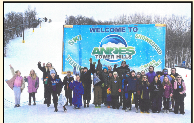
Grades 4-8 enjoyed a day of skiing at Andes Tower Hills last week.