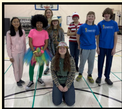
National Lutheran Schools Week Kick-Off Events