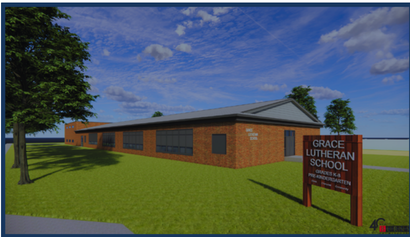
Architect's exterior rendering of pitched roof.