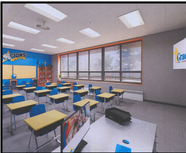
Architect's rendering of a classroom.