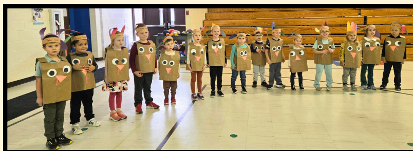
Pre-Kindergarten Turkeys Singing