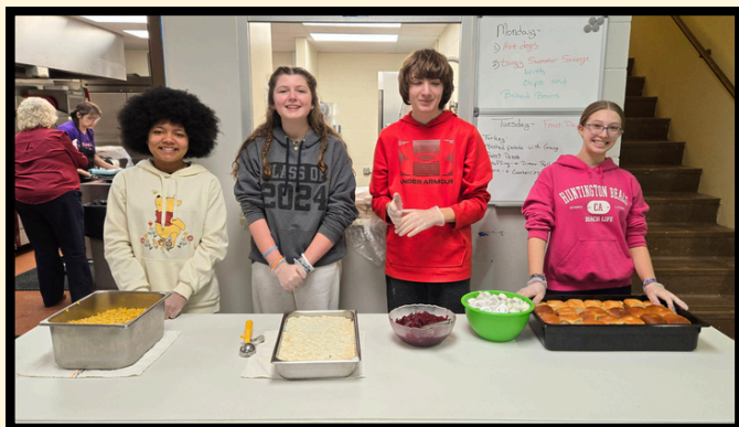
8th Grade Serving Food