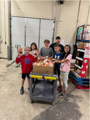
Middle School at the Emergency Food Pantry

It's been a busy month! We had so much fun we hardly realized that an entire month has passed. Check out some of the things our students did this month.