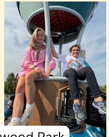
Fun Afternoons at Maplewood Park