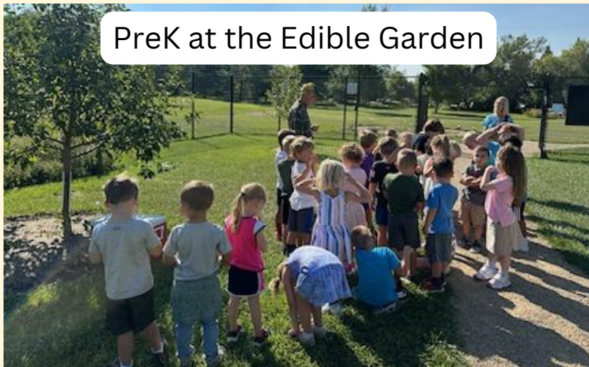
PreK at the Edible Garden