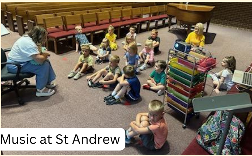
Music at St Andrew