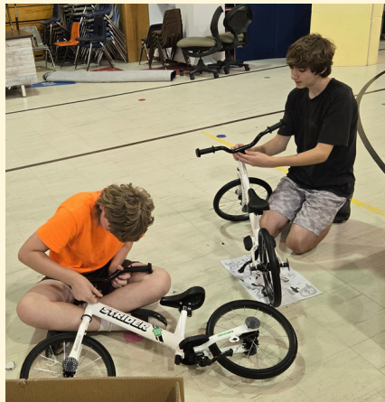
Middle School Assembling the All Kids Bike Bikes