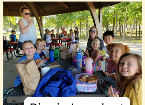
Picnic Lunch at Yunker Farm