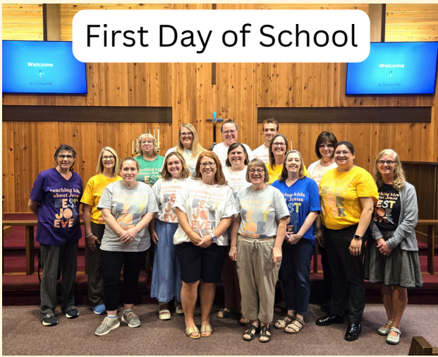
First Day of School