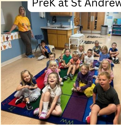
PreK at St Andrew