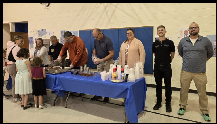
Board of Education Serving Breakfast

HUGE thank you to our PTL for providing homemade German apple pancakes and for our Board of Christian Education for serving breakfast. Our school is so blessed by the service of these wonderful men and women.